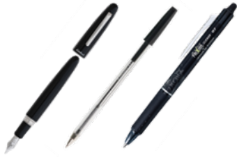
2 Black Pens (cartridge, biro, Frixion or handwriting)

Please can you ensure that your child(ren) have a fully stocked pencil case when they return to school in September. All students must come equipped to all lessons with a fully stocked pencil case, as required by the Henlow Academy Home School Agreement. Regular equipment checks will be taking place from September. Students require the following stationery: