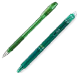
Green Pen (biro or Frixion)