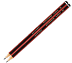
2 HB Pencils