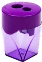
Pencil Sharpener (which collects the shavings)