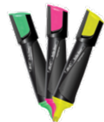
3 Highlighters (different colours)