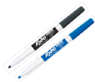
2 Dry Wipe Markers