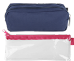
Pencil Case (a clear pencil case is needed when sitting exams)