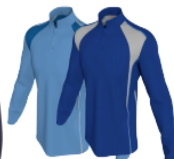
Reversible Rugby Shirt