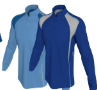
Reversible Rugby Shirt