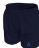
Sport Shorts OR Skort