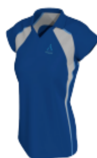
V-Neck Polo Shirt