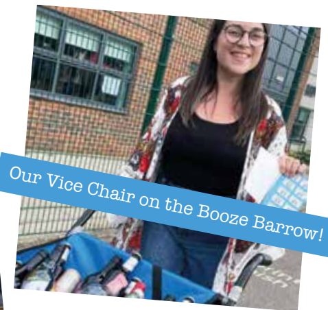
Our Vice Chair on the Booze Barrow!