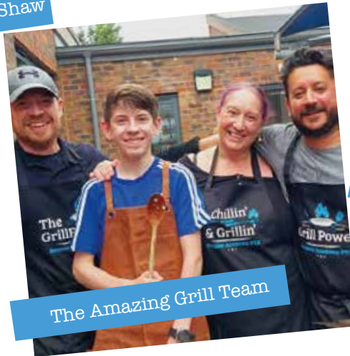
The Amazing Grill Team