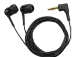
Headphones (suitable to plugged into any tablet/keyboard)