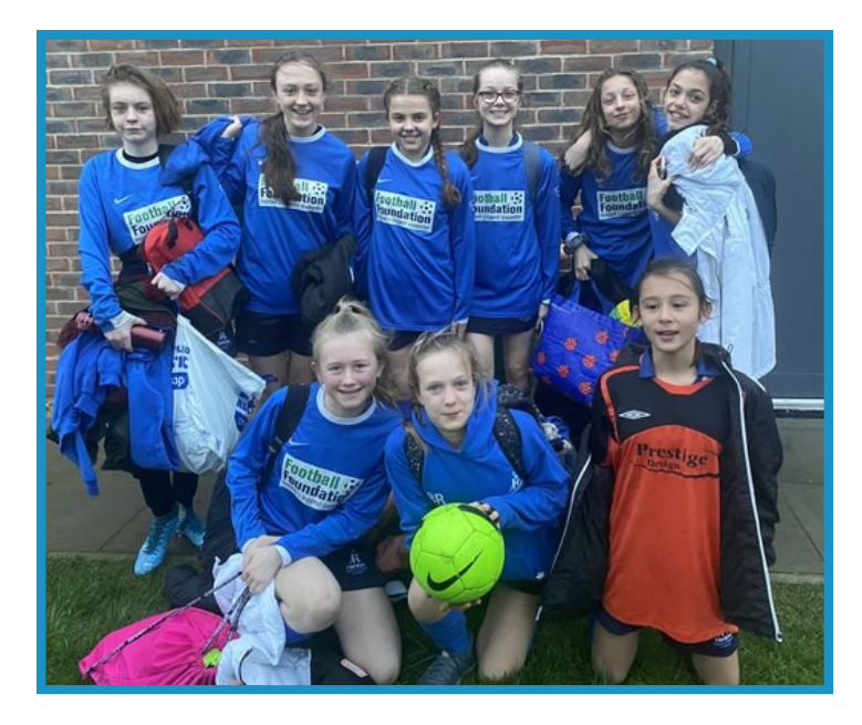
Well done to the girls football team who are through to the next round of the county cup.