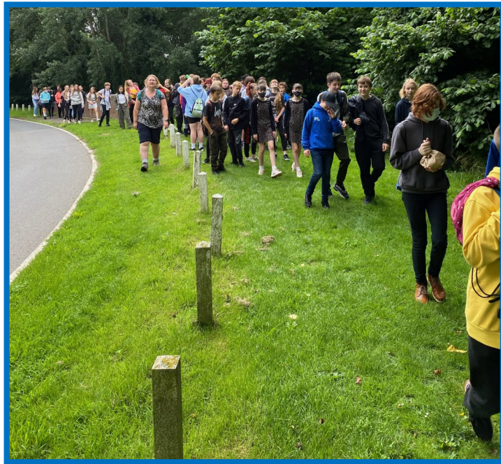
HONESTY - ENTHUSIASM - NURTURE - LOVE - ORIGINALITY - WISDOM