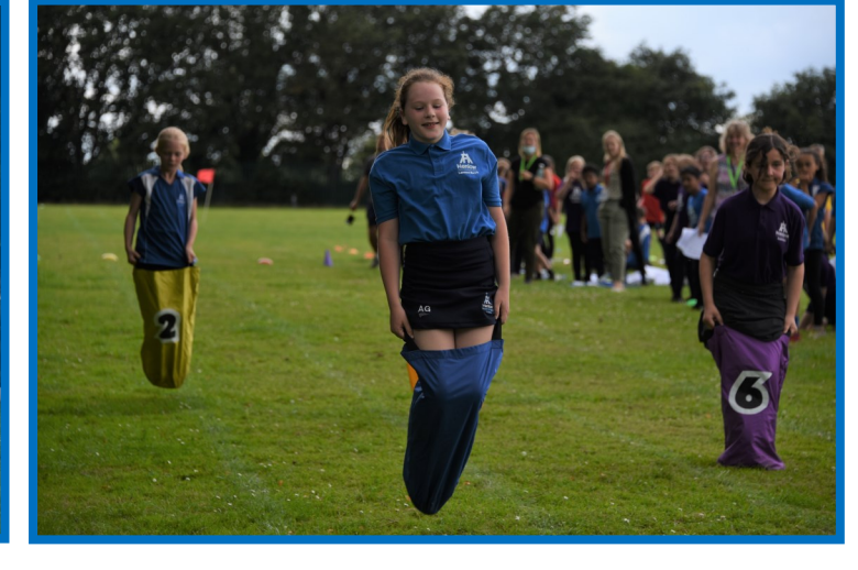
HONESTY - ENTHUSIASM - NURTURE - LOVE - ORIGINALITY - WISDOM