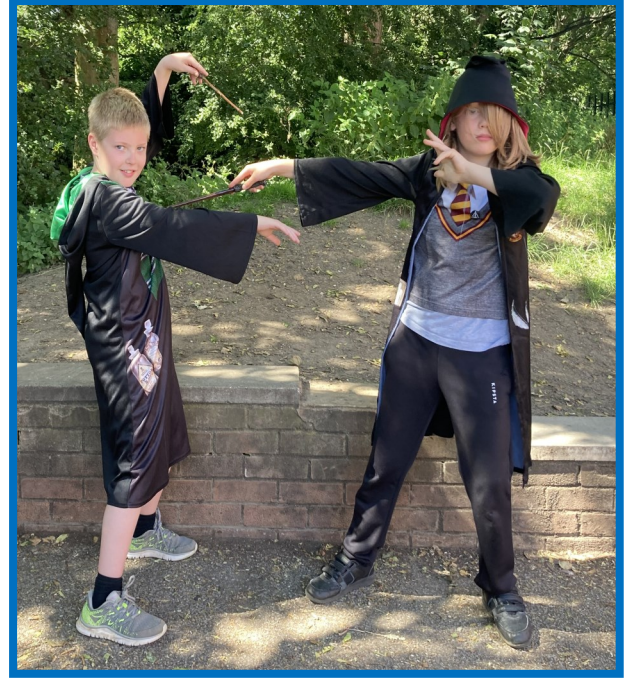
HONESTY - ENTHUSIASM - NURTURE - LOVE - ORIGINALITY - WISDOM