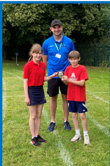
HONESTY - ENTHUSIASM - NURTURE - LOVE - ORIGINALITY - WISDOM