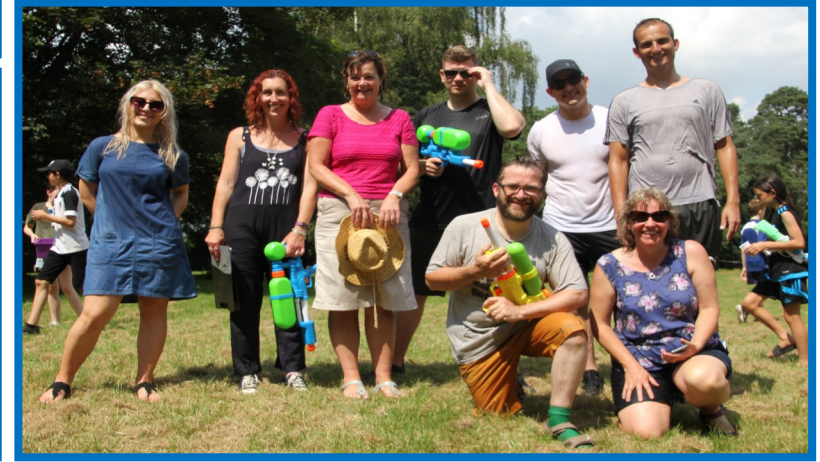
HONESTY - ENTHUSIASM - NURTURE - LOVE - ORIGINALITY - WISDOM