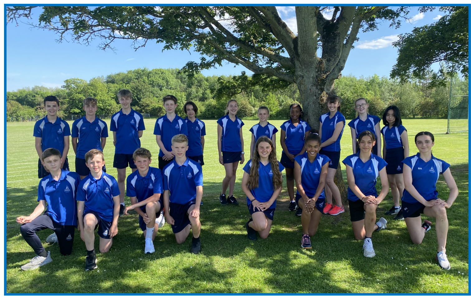
HONESTY - ENTHUSIASM - NURTURE - LOVE - ORIGINALITY - WISDOM