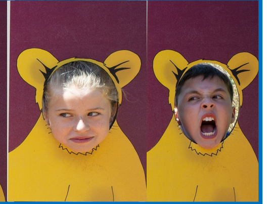
HONESTY - ENTHUSIASM - NURTURE - LOVE - ORIGINALITY - WISDO m