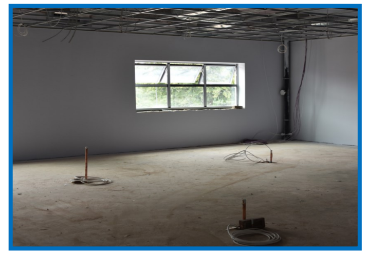
HONESTY - ENTHUSIASM - NURTURE - LOVE - ORIGINALITY - WISDOM