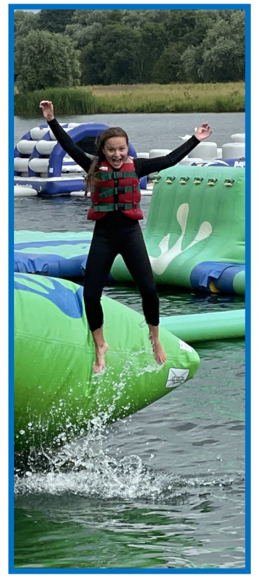
HONESTY - ENTHUSIASM - NURTURE - LOVE - ORIGINALITY - WISDOM