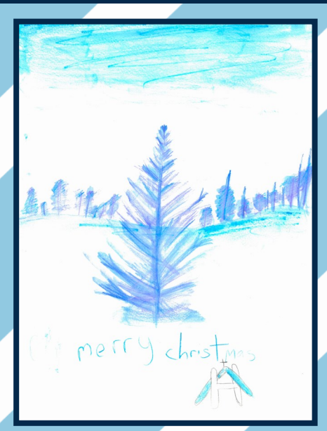
Highly Commended Linnet W