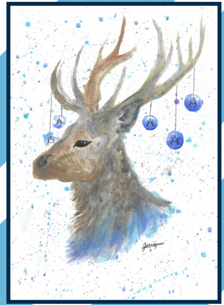
Key Stage 4 Winner Dominique S