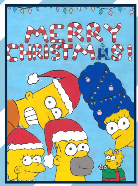
Highly Commended Darcie W