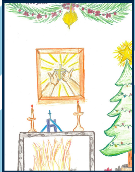
Highly Commended Emily L