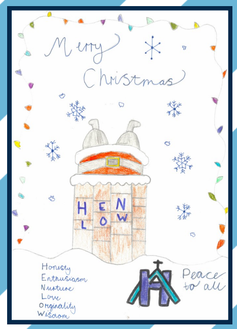
Key Stage 2 Hollie W