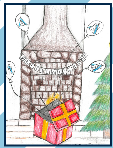
Highly Commended Lani C