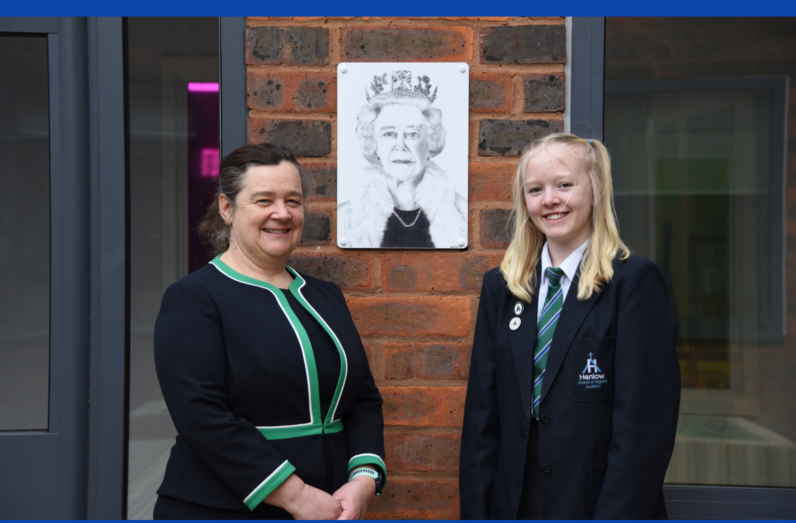
'I have come that they may have life, and have it to the full.' John 10:10